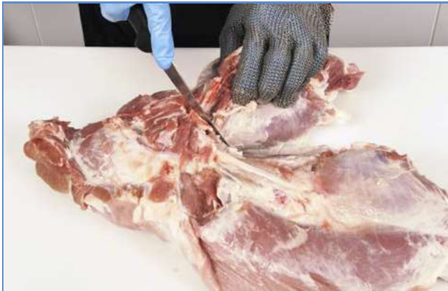
1 The Thick Flank is removed from the leg...