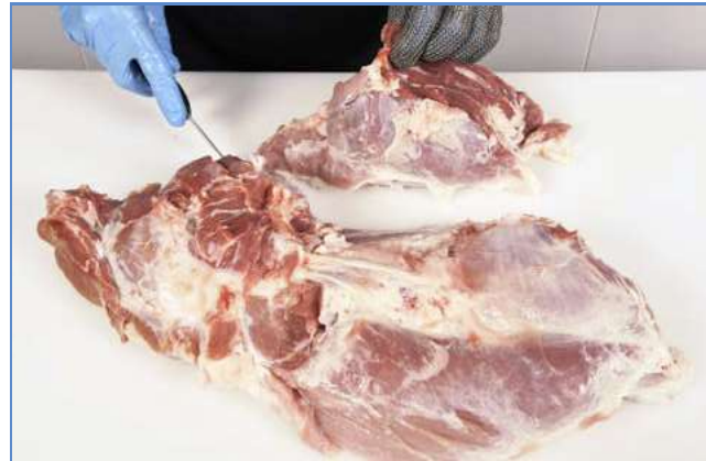
2 ... by following the natural seams.