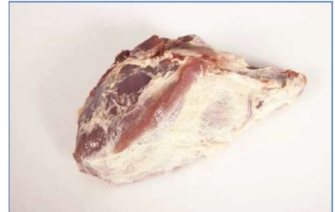
3 Thick Flank.